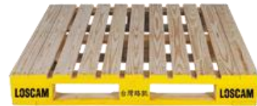
(left to right) Loscam Taiwan Pallet, WP3; Loscam Taiwan Pallet, WP9; Loscam ECR Pallet, WP