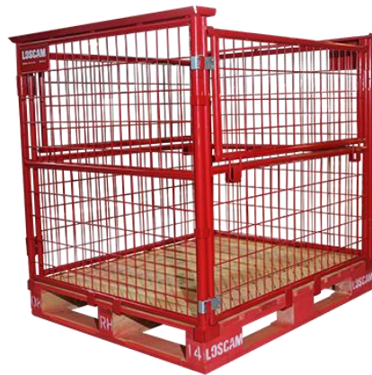
(left to right) Loscam Repairable Plastic Pallet, PP2; Loscam Pallet Cage