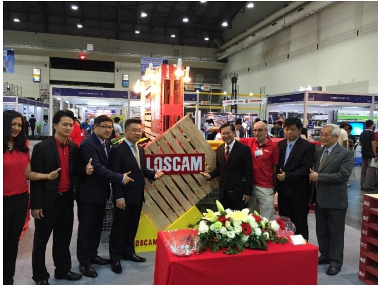
Group photo of Loscam Thailand, VIPs from Ministry of Industry Thailand, The Thai Chamber of Commerce, and representatives from Exhibitors