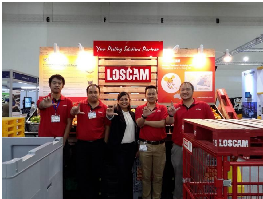
Group photo of Loscam Thailand staff in front of the company booth